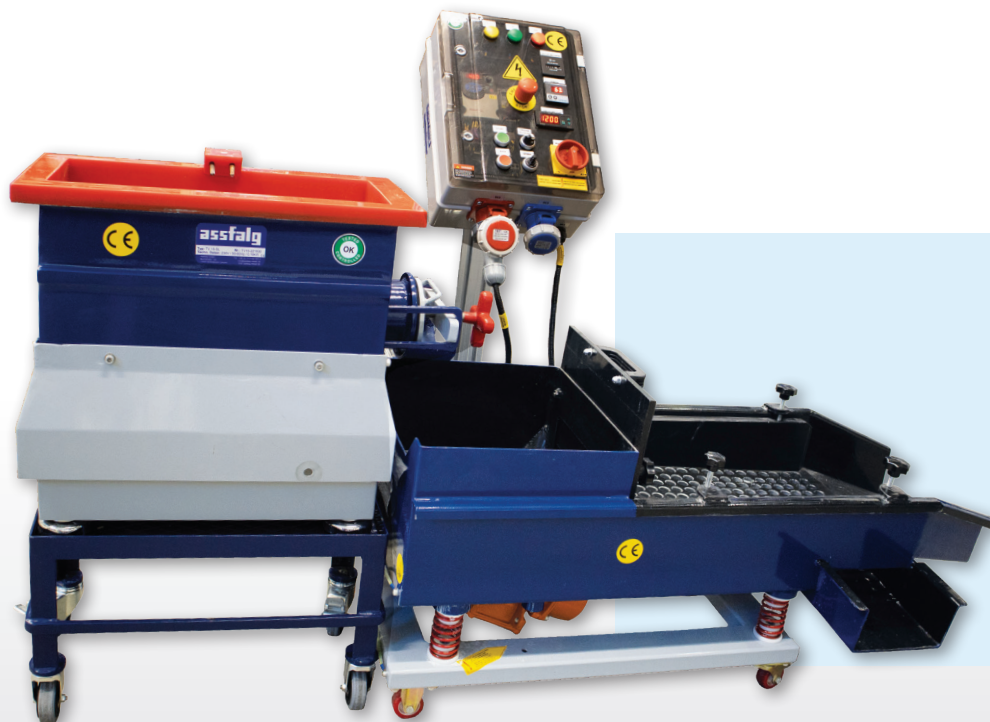
TV 15-SL with Separator