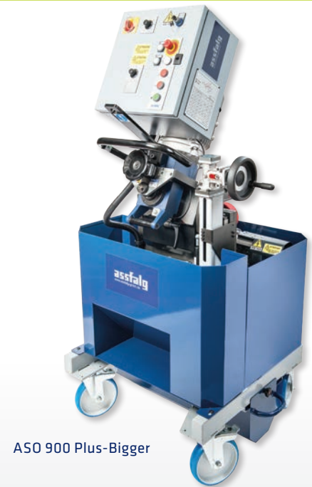
ASO 900 Plus-Bigger