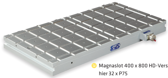
🔗 Magnaslot 400 x 800 HD-Version, hier 32 x P75