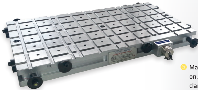
☺ Magnaslot 400 × 600 mm: ECO version, reduced number of poles on the clamping surface - here 45 × P50.

Patent No. EP1874504 solid steel surface