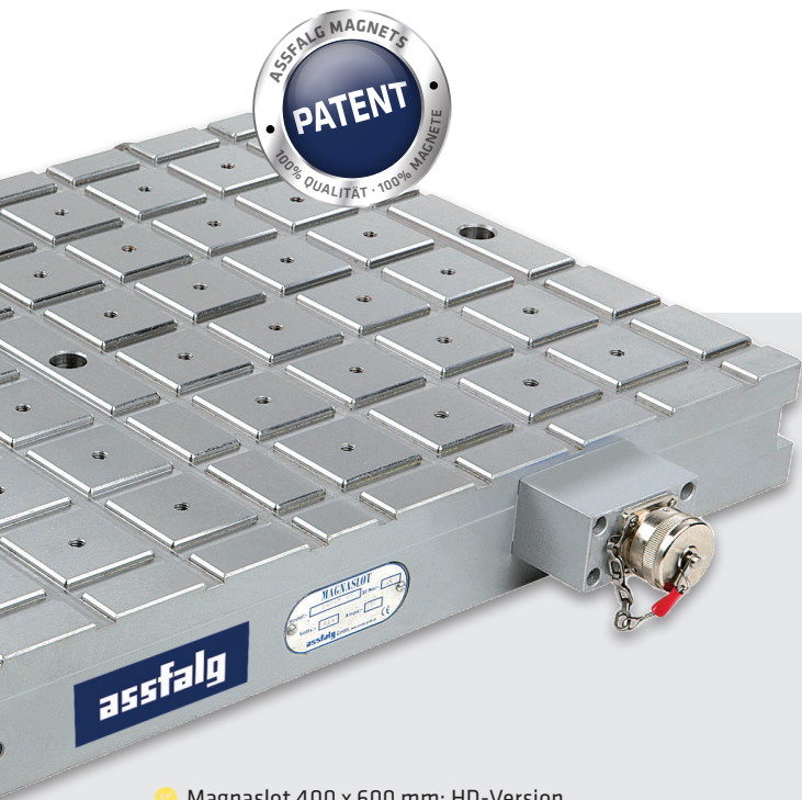
🔗 Magnaslot 400 x 600 mm: HD-Version max. pole number on the clamping surface - here 48 x P50